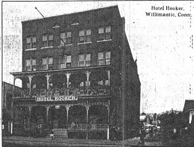
Hotel Hooker, Willimantic, Conn.