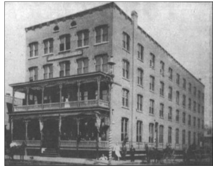
Then - Hooker House Hotel 1894.

The lens of H. W. Rich's camera caught the Hooker House Hotel in its Victorian pomp in this 1894 photograph. A chamber maid looks out from the balcony, and a large group of well dressed, bowlerhatted men look out from the front porch at the cameraman. It is perhaps no coincidence that a bar and billiard room was located directly behind them. Note the 1926 Nathan Hale Hotel in the modern view, built because the Hooker's 100 rooms could not cater for the city's growing number of visitors.